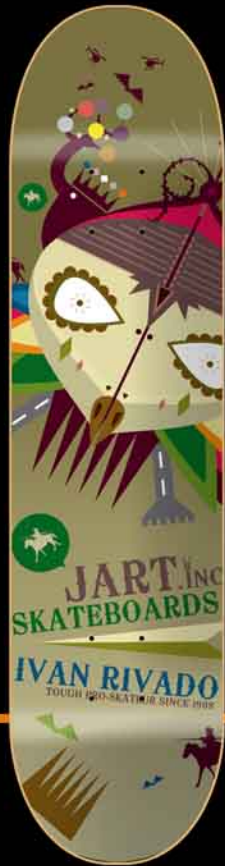
POANA RIVADO 7,625" * 31,125"