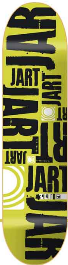
LOGO III 7,375" * 31,125"