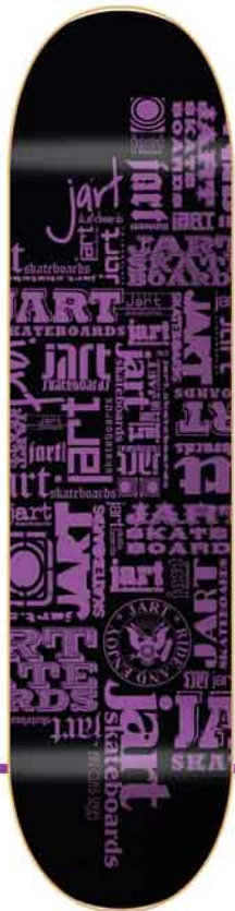
CLASS 7,375" * 30,8"