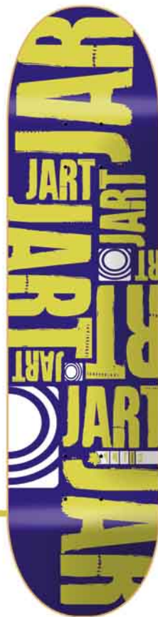
LOGO III 7,75" * 31,375"