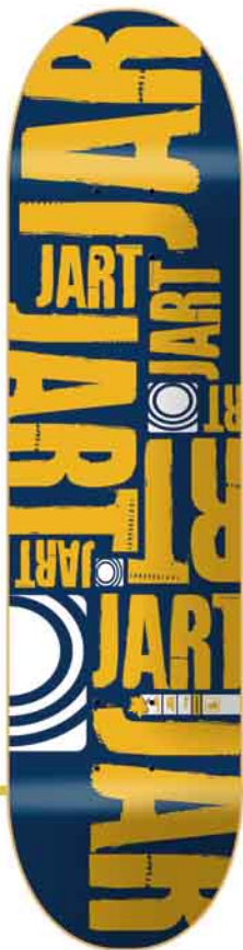
LOGO III 7,5" * 31,125"