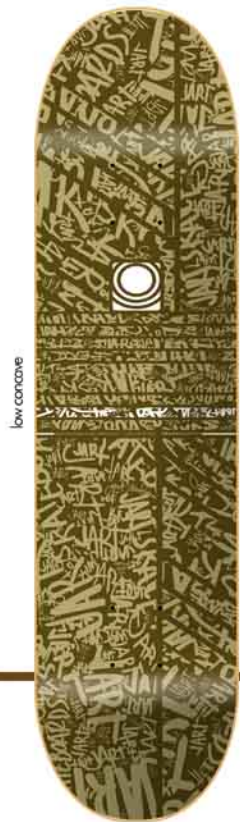
JUNIOR-TIPOMANIA 7,25" * 28,5"