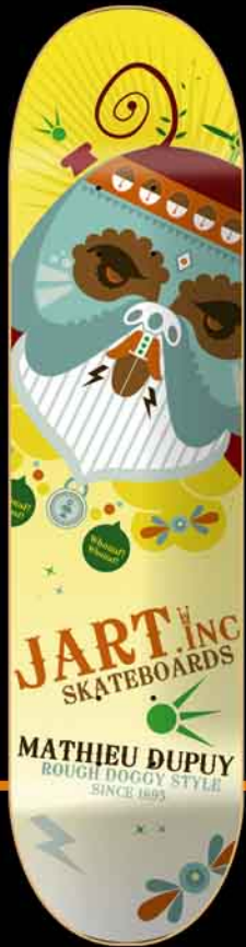
POANA DUPUY 7,5" * 31"