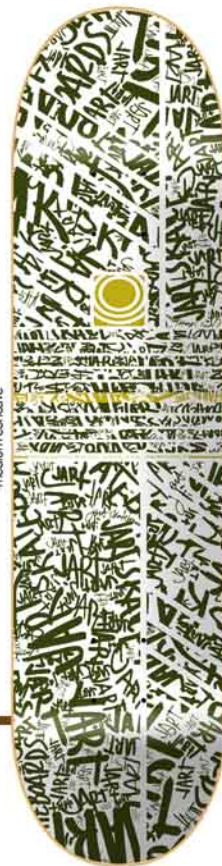
TIPOMANIA 8,25" * 32,125"