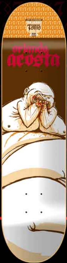
GLUTTONY ACOSTA 7,5" * 30,625"