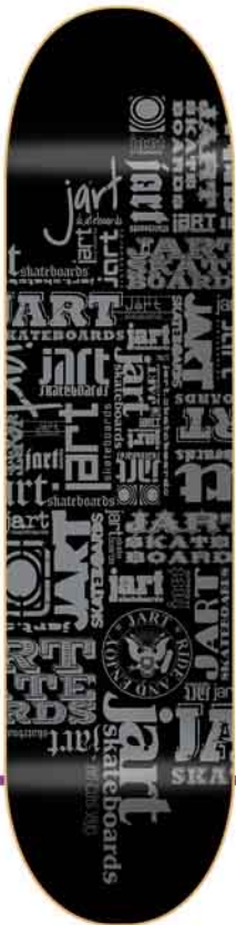
CLASS 7,75" * 31,2"