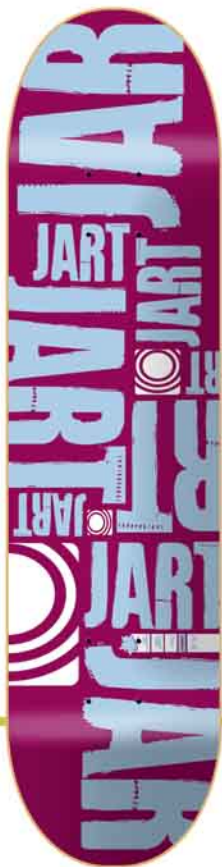
LOGO III 7,625" * 31,3"