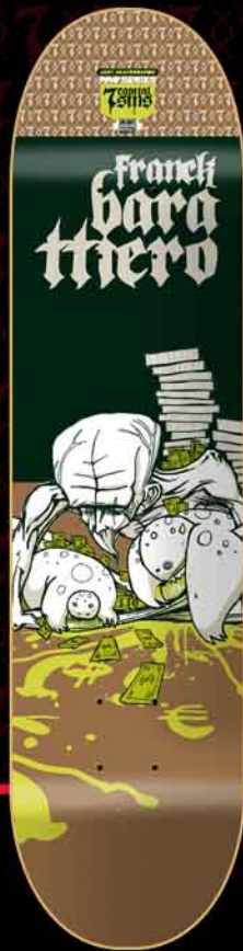
GREED BARATTIERO 7,375" * 30,5"