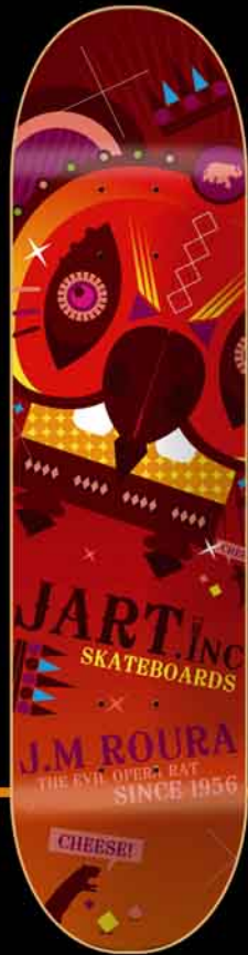
POANA ROURA 7,5" * 31"