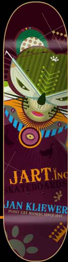
POANA ACOSTA 7,875" * 31,375"