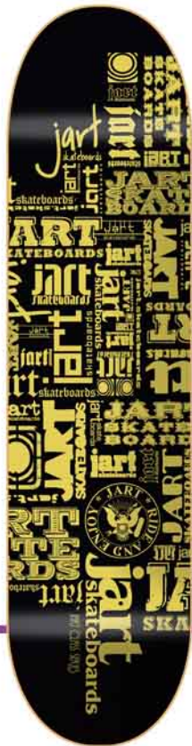
CLASS 8" * 32"