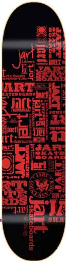
CLASS 7,875" * 31,3"