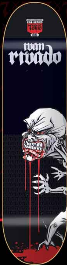
WRATH RIVADO 7,5" * 30,625"