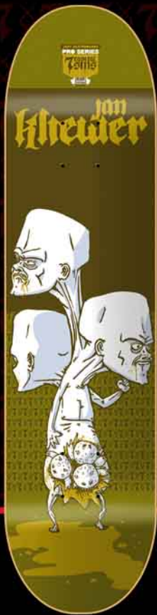
ENVY KLIEWER 7,875" * 31,125"