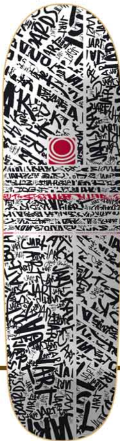
POOL-TIPOMANIA 8,625" * 32,25"