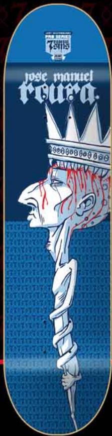
PRIDE ROURA 7,625" * 30,875"