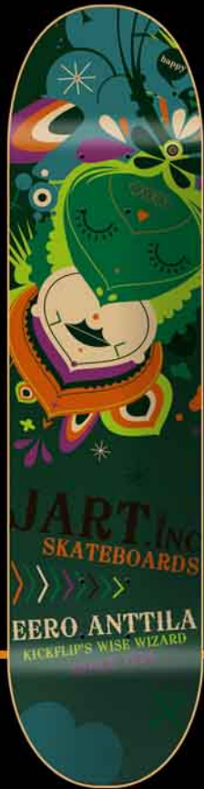
POANA ANTTILA 7,625" * 31,125"