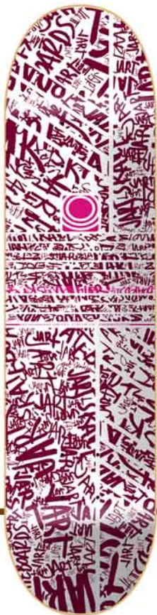
TIPOMANIA 8,125" * 32"