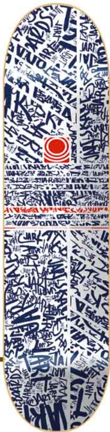
TIPOMANIA 8" * 32"