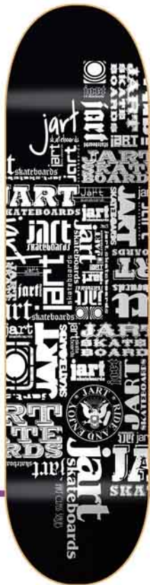
CLASS 7,625" * 31,1"