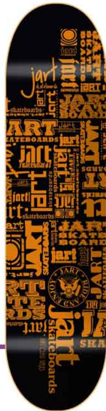
CLASS 8,125" * 32"