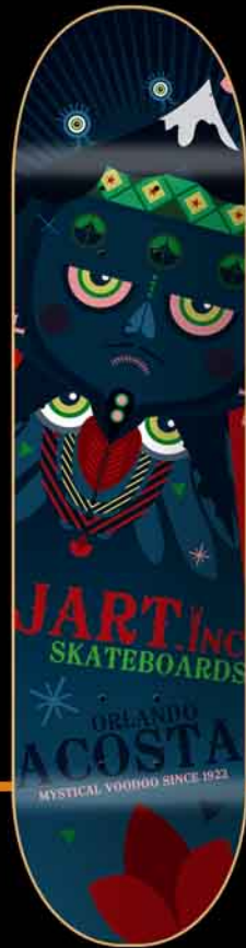
POANA KLIEWER 7,75" * 31,25"