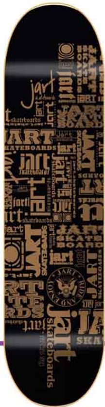
CLASS 7,5" * 31"